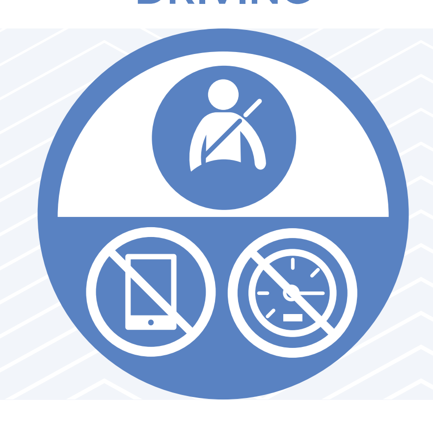
Follow safe driving rules