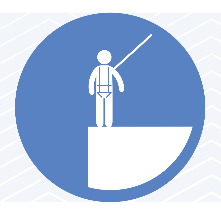
Protect yourself against a fall when working at height