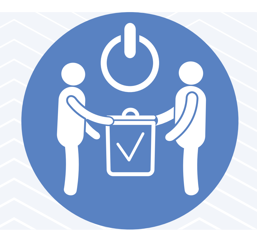
Obtain authorization before overriding or disabling safety controls