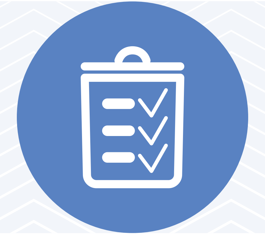
Work with a valid permit when required