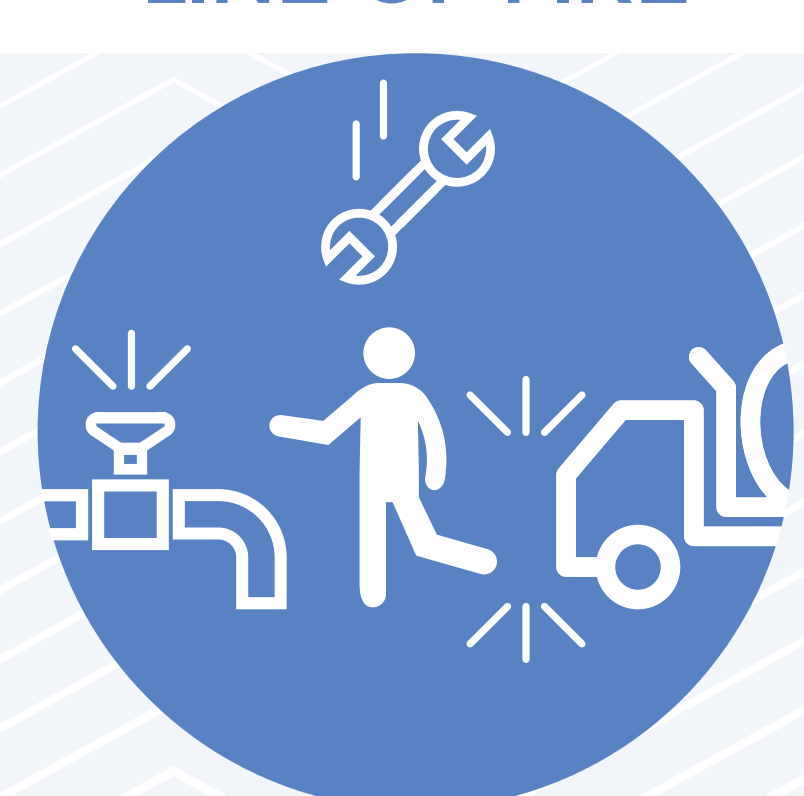
Keep yourself and others out of the line of fire